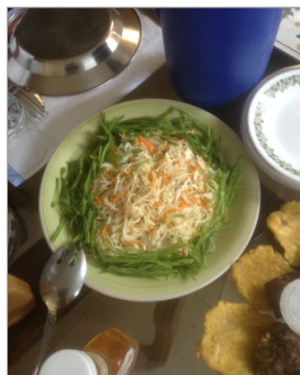
Pikliz (spicy Haitian coleslaw)

Cut into very thin slivers white cabbage, carrots, onions, shallots, 1 hot red pepper, 1 hot green pepper, 1 red pepper & 1 green pepper. Add 1 garlic clove minced and 3-4 peppercorns, 1 tablespoon of sugar. Place ingredients in jar and cover with boiled white vinegar, filling the jar. Add a pinch of salt.