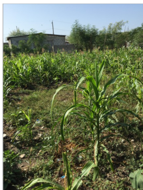
Corn field at Unity House