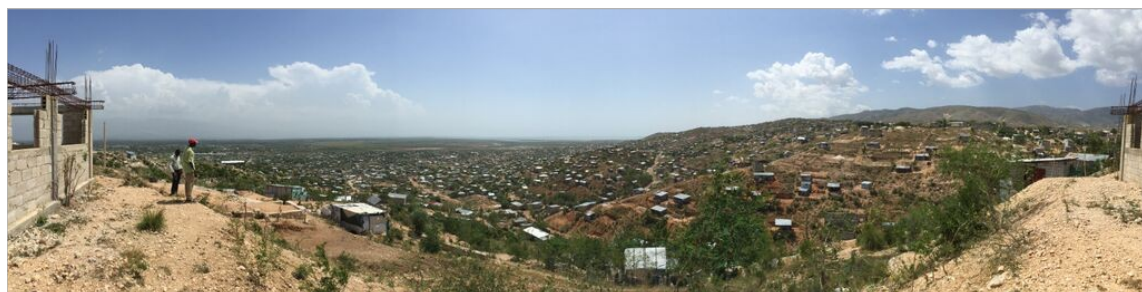
View of Canaan