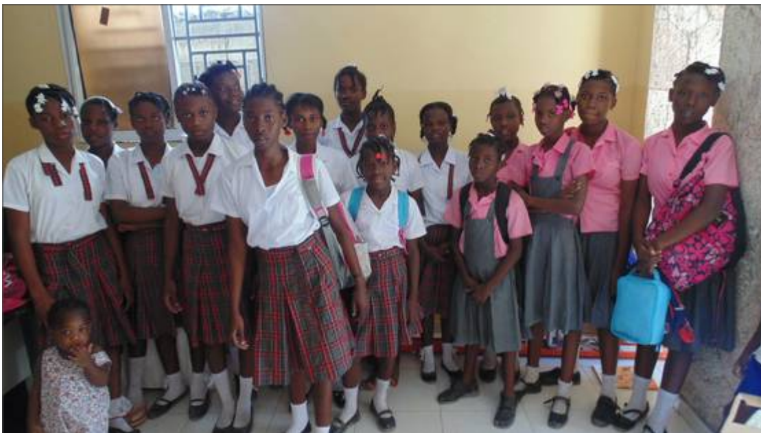
Ready for school at KPN