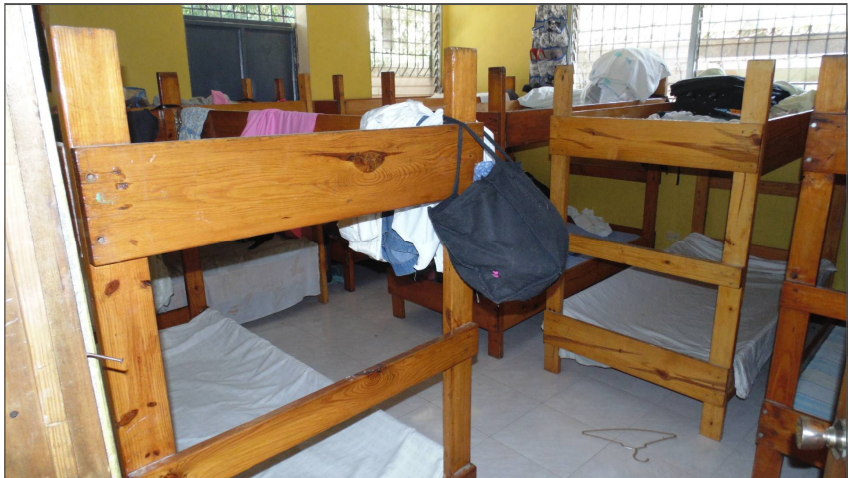
Bedroom filled with beds